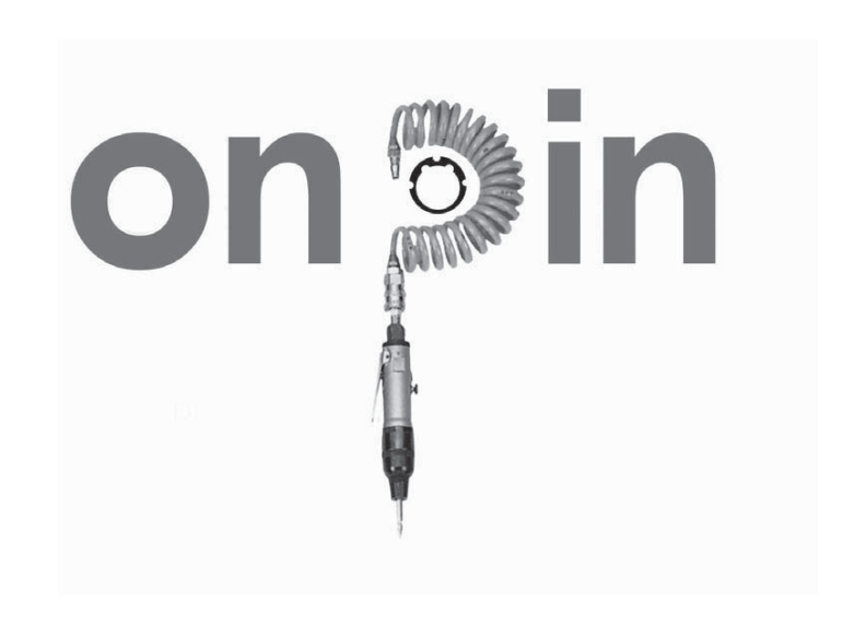
NO.22,KOU SHIN RD.,SHENKANG DIST., TAICHUNG CITY,TAIWAN